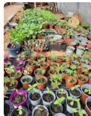
Potting up on a grand scale