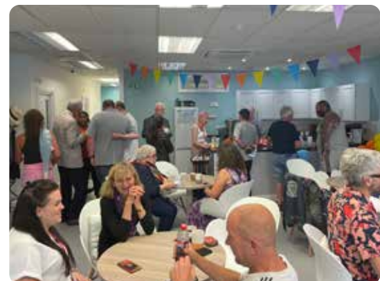
Guests at our busy launch