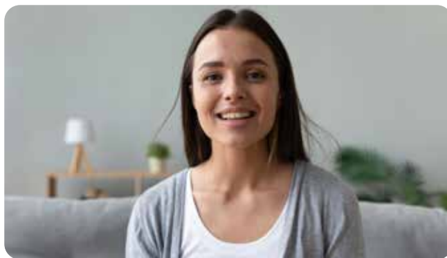
Posed by model

Once PA's use had reduced, we focused on relapse prevention and career support. We discussed medication for ADHD and whilst this can be helpful