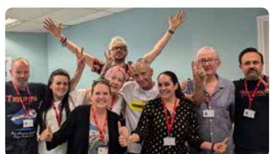
Some of our amazing Medway team