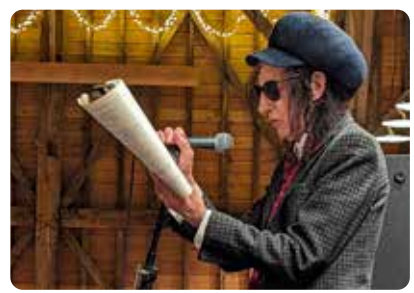
Dr John Cooper Clarke takes the stage!

Thanks to all our amazing funders, fundraisers and donors, old and new, for supporting us, we're so grateful to you. All money raised funds our frontline services to some of the most vulnerable people in our local communities. We quite literally couldn't do what we do without you. Thank you.