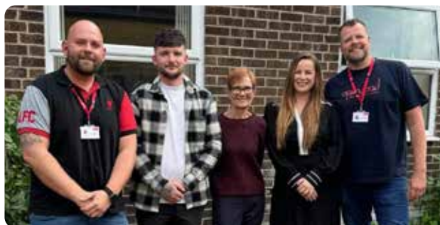
Councillor with South Essex team