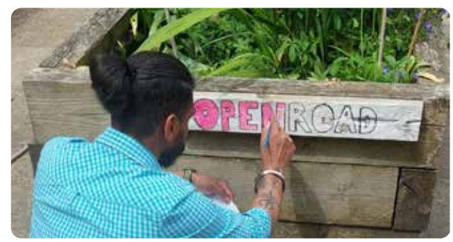
Open Road's Walled Garden Project