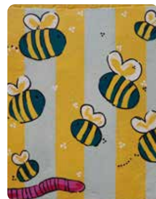
Harlow's bee friendly gardens