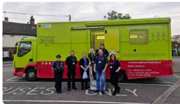
SOS Bus - Braintree Community Safety Impact Nights

Open Road has also received Public Health Accelerated Bid (PHAB) funding for 18 months and this will support combatting health inequalities in marginalised and rural North Essex. The SOS Bus will be an integral part of this service, with services by