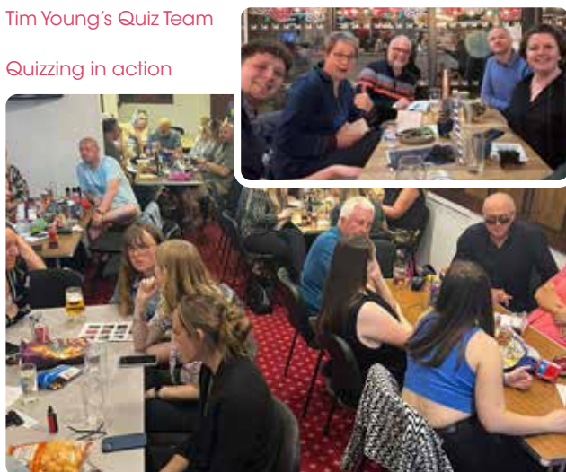
Quizzing in action

Spring and Summer have been a busy time too for networking and submitting funding award applications, which is a big part of my role. There are a lot of charitable Trusts and Foundations, plus corporate charitable foundations but each has specific criteria for the type of charities and work they can award grants to; as you can imagine, we sometimes fit that criteria and sometimes we don't, so there's a lot of research and background work done prior to applications being submitted. We recently had some brilliant news that HSBC's charitable arm for good causes has awarded us £20,000 capital fund which we will use towards our Harlow Centre – we thank HSBC for their generosity which will make a massive difference to our frontline service. We have also received funding awards from the following amazing funders, and we thank them all for their kindness: