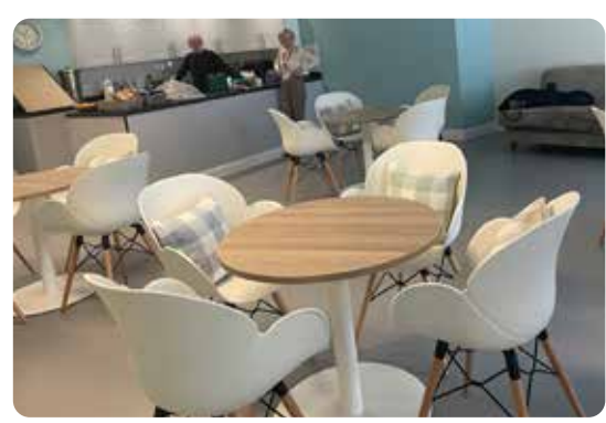
Ready to welcome guests