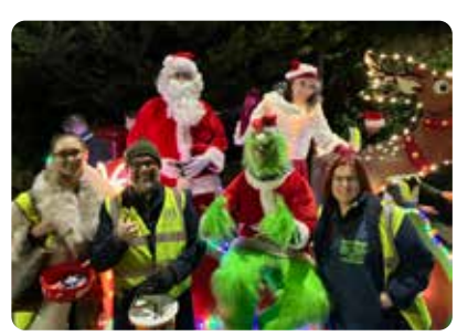
Open Road Team with Father & Mother Christmas