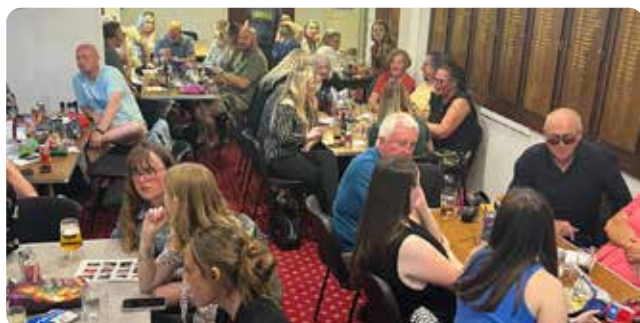
Quizzing in action