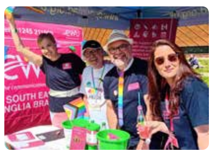
Open Road team at Colchester Pride