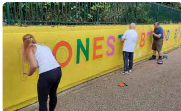
Artwork in progress