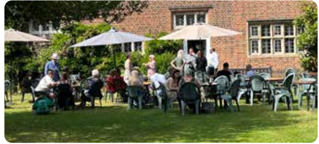
Tea Party Guests in the summer sunshine

Our many thanks to Volunteering Matters and Southend's Mayoral Team for their generous invite to Open Road, it was really kind of you and we are grateful to you.